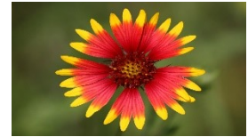
This Photo by Un-